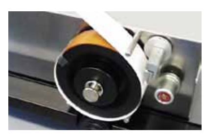
Mounting substrate for gravure

The low cost version is the F1 Basic. In this version the printing speed can be adjusted to 0,3; 0,6 or 0,9 m/s. The anilox/printing force can be set to 20/30, 40/60 or 60/90 N for the type Low and on 100/150, 200/300 or 300/450 N for the type High. The F1 Basic is used when there is no need to change the speed or aniloxand printing force within small limits. This tester is specially used in QC of inks and/or substrates. The type Low is the best choice if only halftone printing forms are used and the type High when only prints in full tone are made.